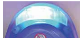
Blue: good chest compression