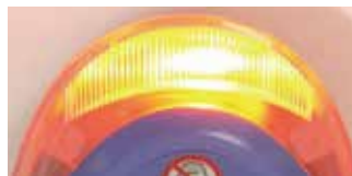
Orange: tempo indicator

CPR assist shows the depth and tempo of chest compressions by LED and audio. This real-time feedback helps you adjust your compressions to perform higher quality CPR. It also supports easier CPR training.